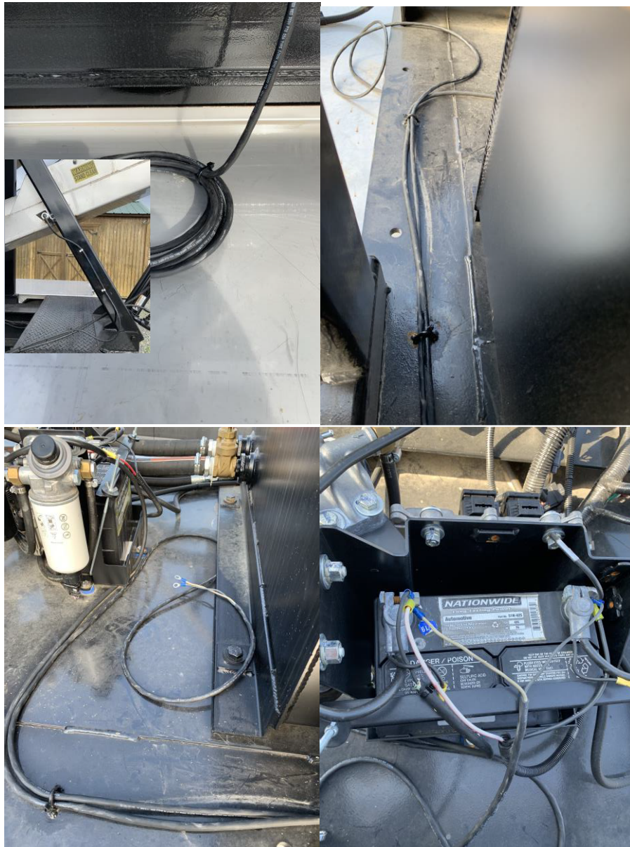
Step 10: Use cable hold downs to secure cord to H pillar.

Step 10: Remove zip tie from the cord with ring terminals attached and route to the battery. Attach black wire to negative post, and white wire to positive post.